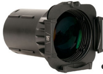
EP LENS 19