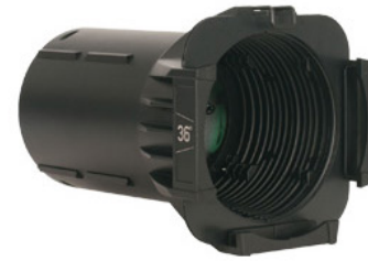
EP LENS 36