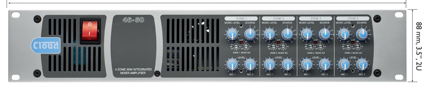
46-50 - front panel view