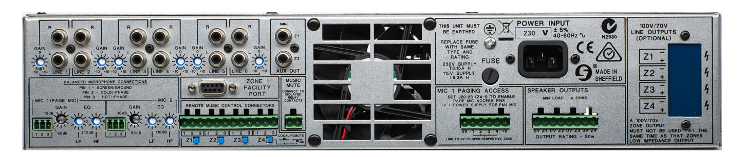
46-50 - rear panel view