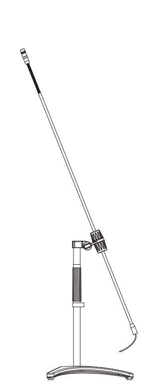
FGM-62 Carbon / FGM-170 Carbon