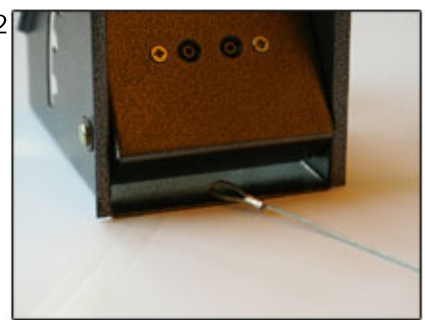
Place the wire loop under the main body of the variable angle pod.