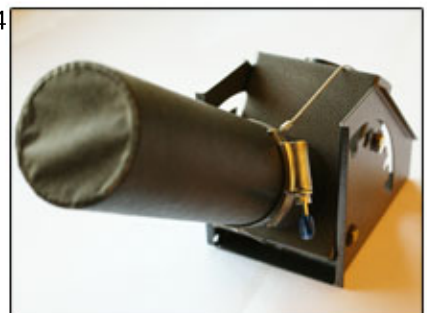
Pull the jubilee clip up the cartridge to tension the wire and tighten.