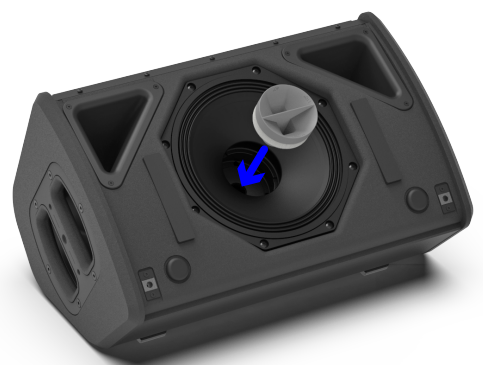
Grille removed, an optional magnetic horn can be quickly fitted to change directivity from 100°x100° to 110°x60°

P8 acoustic phase response is NEXO phase signature allowing inter-operability between all NEXO speakers at all crossover points, except for the monitor setups where latency is minimized.